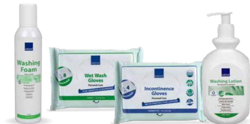
■ Washing without Water