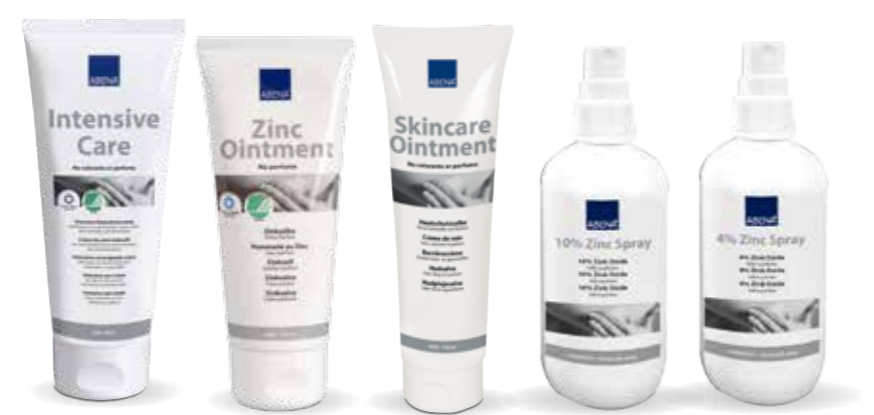
■ Special Creams & Ointments