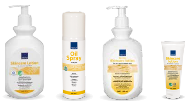
■ Creams & Lotions